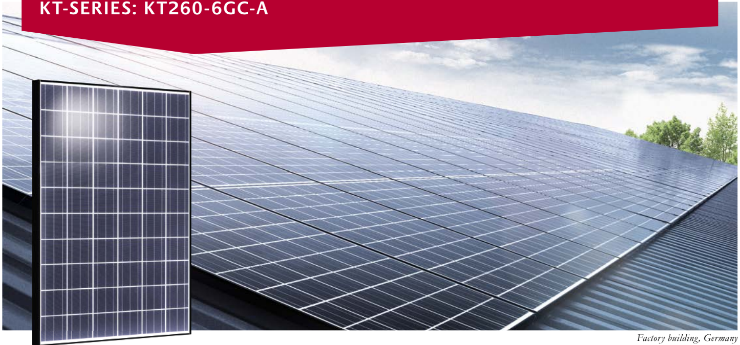
Factory building, Germany